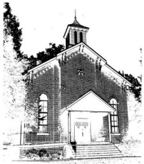
Tyrone Presbyterian Church

402 Jimtown Rd, Dawson, Pennsylvania 15428, United States